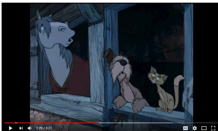
101 Dalmatians - 15 Spotted Puddles Stolen.

Like so (whereby, we're looking for more like 150'000 spotted puddles stolen):