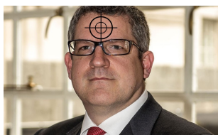
Andrew Parker, MI5