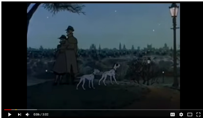
101 Dalmatians The Twilight Bark

https://www.youtube.com/watch?v=Ed_Kxyqgp1c