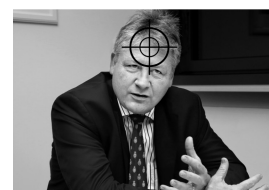
Dr. Bruno Kahl, BND