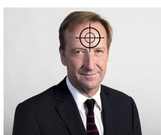
Alex Younger, MI6