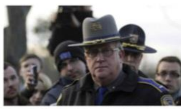
: Pay raying 17 Data Police systement at a prese conference on far from the Sandy shock December Scho