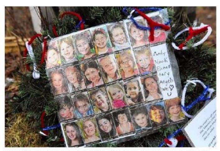
Photos of Sandy Hook Elementary School victims sit at a small memorial near the school on Jan. 14, 2013, in Newtown, a month after the horific massacre that claimed 20 children and six women at the school. (Getty Images / January 15, 2013)

parents and relatives of the victims still relive the terror of that fateful day along with the daily anguish and torment they suffer over the loss of their loved ones.